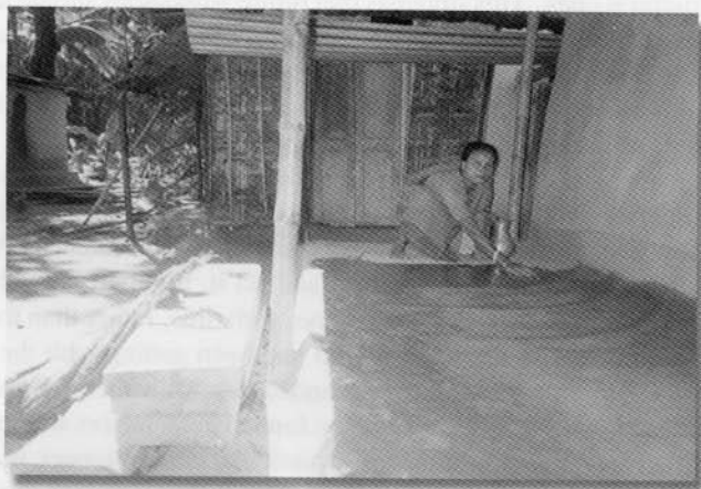
Figure 1 : A woman carries out weekly plaster maintenance on her mud verandah

construction requires the use of tools and is thus done by men; mud walling is much more a hands-and-feet activity and is often done by women.